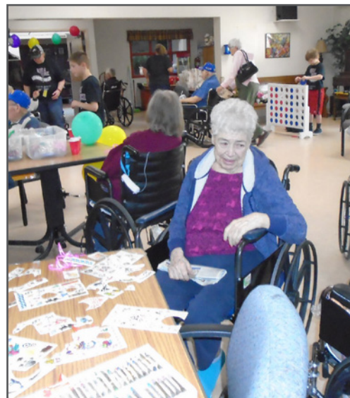
Residents enjoy time at the Spring Carnival