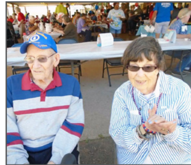
7 of our residents got to attend Breakfast on the Farm